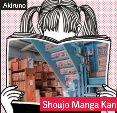
Shoujo Manga Kan