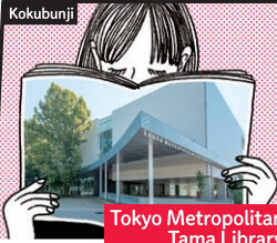
Tokyo Metropolitan Tama Library

With over 18,000 of the past years magazines and over 240,000 children's and youth materials, the Tokyo Magazine Bank has the largest collection in Japan!