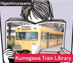
Kumegawa Train Library