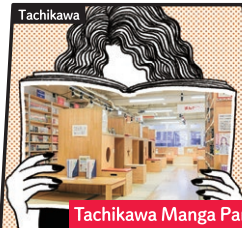
Tachikawa Manga Park

With tatami mats as far as the eye can see, this house of manga is the perfect place to grab a story and crash out on the floor.