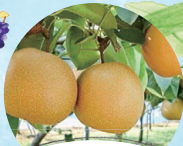
Lake Tama Pears

Yamauchi Vineyard ☎ 03-3300-5741 📍 3-28-7 Wakabacho, Chōfu ☺ 10:00 to 15:00 / Open for only a couple of days in the final weeks of August, be sure to check their website.