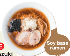
Soy base ramen

📍1-37-6, Koyasumachi, Hachiōji ⌚11:30 to 15:00, 19:00 to 21:30 (Open nights only on Thursdays, Fridays and Saturdays)/Closed on Tuesdays and national holidays